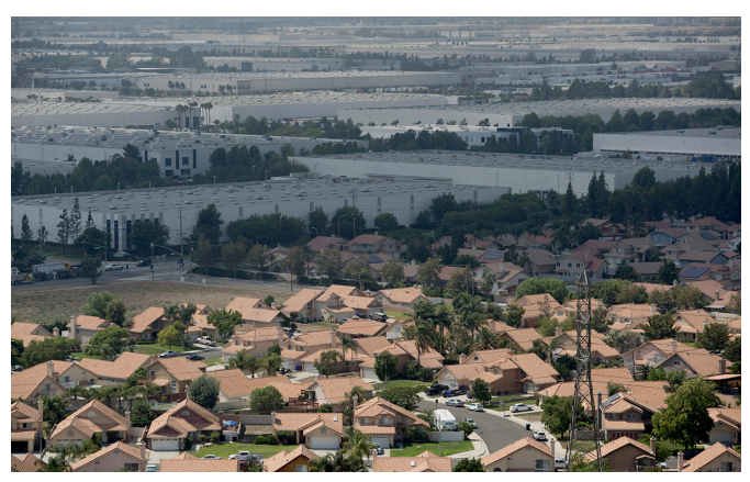
A vast industrial area that includes numerous logistics facilities near homes in Rancho Cucamonga and Fontana.

The South Coast AQMD is responsible for improving air quality across Los Angeles, Orange, Riverside and San Bernardino counties. The region has some of the nation's worst smog, largely driven by warehouses and trucking emitting lung-damaging soot.