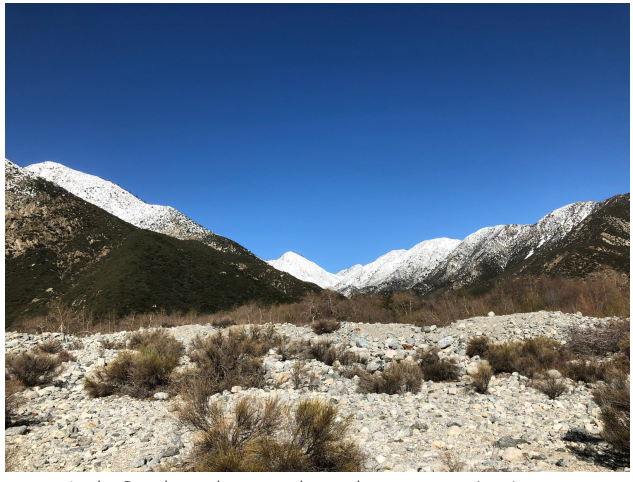
Lytle Creek wash near where the construction is happening.

The US Forest Service (USFS) has a management draft plan in place that includes conceptual maps for improvements at eleven project sites. With passage of the Great American Outdoors Act, construction has finally begun on one of the most impacted areas. The Hidden Acres project includes additional off-highway parking, restrooms, graded paths down to the creek, and trailhead for the popular Bonita Falls hike. This project was November and awarded in late completion is expected in June of 2024 in time for the summer recreation season.